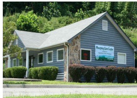
Mountain Care Center