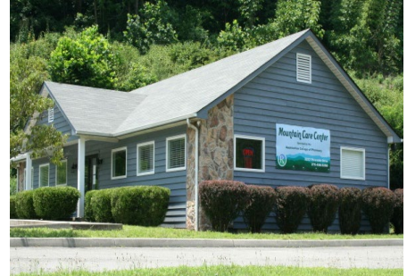
Mountain Care Center