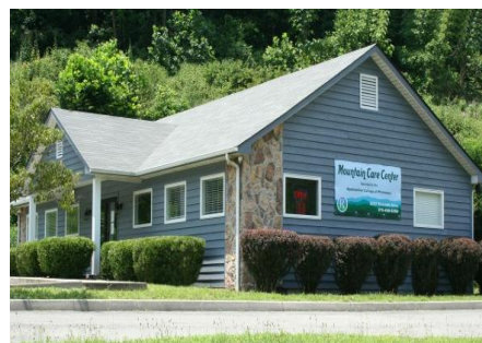
Mountain Care Center