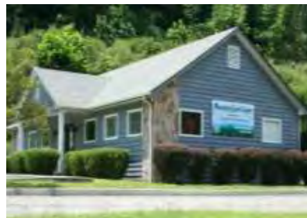
Mountain Care Center