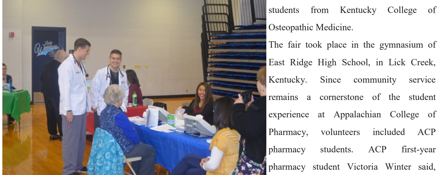
Medical students from KYCOM

Residents of rural Pike County, Kentucky were treated to the Eastern Ridge Health Fair, organized by the Kentucky College of Osteopathic Medicine in collaboration with Appalachian College of Pharmacy and other community partners. This free health fair was offered from 8am to 4pm on Saturday February 6, 2016. The event which required no pre-registration, was open to the public and provided health care screenings, including access to various medical services. ACP pharmacy students and faculty provided screenings for blood pressure, blood sugar, and medication counseling. There was also educational information on diabetes, high cholesterol, and hypertension available. Osteopathic manipulative exams and medical treatments were performed by medical